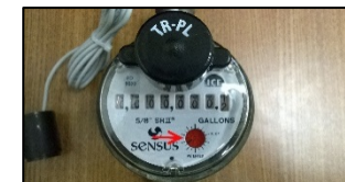
Figure 3 - Meter

Step 4. Locate the main shut-off valve to the house (if you have one). This is usually located close to the meter box or up next to the house. The location of your personal shutoff valve is unknown to the County.