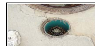
Figure 5 – Main Shut Off Valve

Step 6. Turn on a faucet inside the house to test.