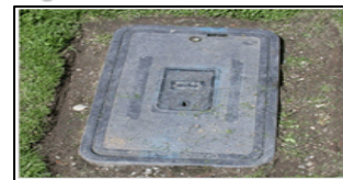
Figure 2 - Meter Lid

Step 3. Take the lid off the meter box and lift the protective cover carefully to ensure wires do not get detached.