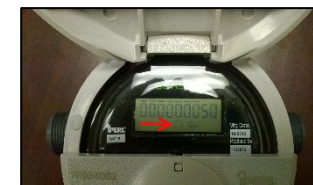
Figure 4 – New Omni Meter

Step 4. Locate the main shut-off valve to the house (if you have one). This is usually located close to the meter box or up next to the house. The location of your personal shutoff valve is unknown to the County.