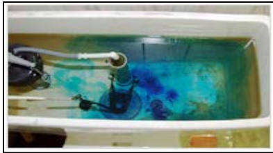
Figure 6 – Back of toilet with Dye

Wait 15 to 30 minutes. If the water in the bowl changes color, the flapper valve needs to be replaced. For a possible slower (silent) leak, you will want to check after an hour or longer.