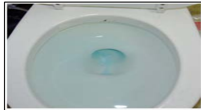
Figure 7 – Dye leaking into bowl

Step 9. If you have an irrigation system connected to the County system and did not find the leak between the meter and shut-off valve and inside the house, then the leak could be in the irrigation system.